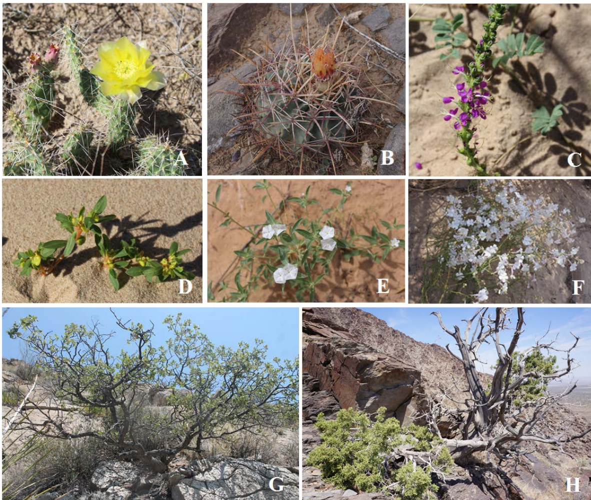
Figure 3. Examples of the flora of the Médanos de Samalayuca protected area. A) Opuntia arenaria ; B) Homalocephala parryi ; C) Dalea lanata ; D) Euphorbia carunculata ; E) Euploca convolvulacea ; F) Penstemon ambiguus ; G) Quercus pungens ; H) Juniperus arizonica .

The richest genera in Samalayuca are Euphorbia , Opuntia , Boerhavia , and Aristida . Euphorbia is also the richest genus in the gypsum dunes of Cuatro Ciénegas, White Sands, USA, the halophytic grasslands of Janos, and in different Mexican coastal sand dunes (Pinkava 1984, Anderson 2007, Vega-Mares et al. 2014, Espejel et al. 2017). As for Opuntia , nine species are recognized following the criteria of specialists, but a lot of taxonomic work is still needed in that genus. For example, Opuntia camanchica is part of the Opuntia phaeacantha complex and may represent a morphotype of that species. However, since there is no clear understanding yet in the group, O. aff. camanchica is kept in the list. On the other hand, Salvia , the largest genus in Mexico and in the Lamiaceae (Martínez-Gordillo et al. 2017; González-Gallegos et al. 2019), has not been found yet in Samalayuca; although, it is well represented in gyp-