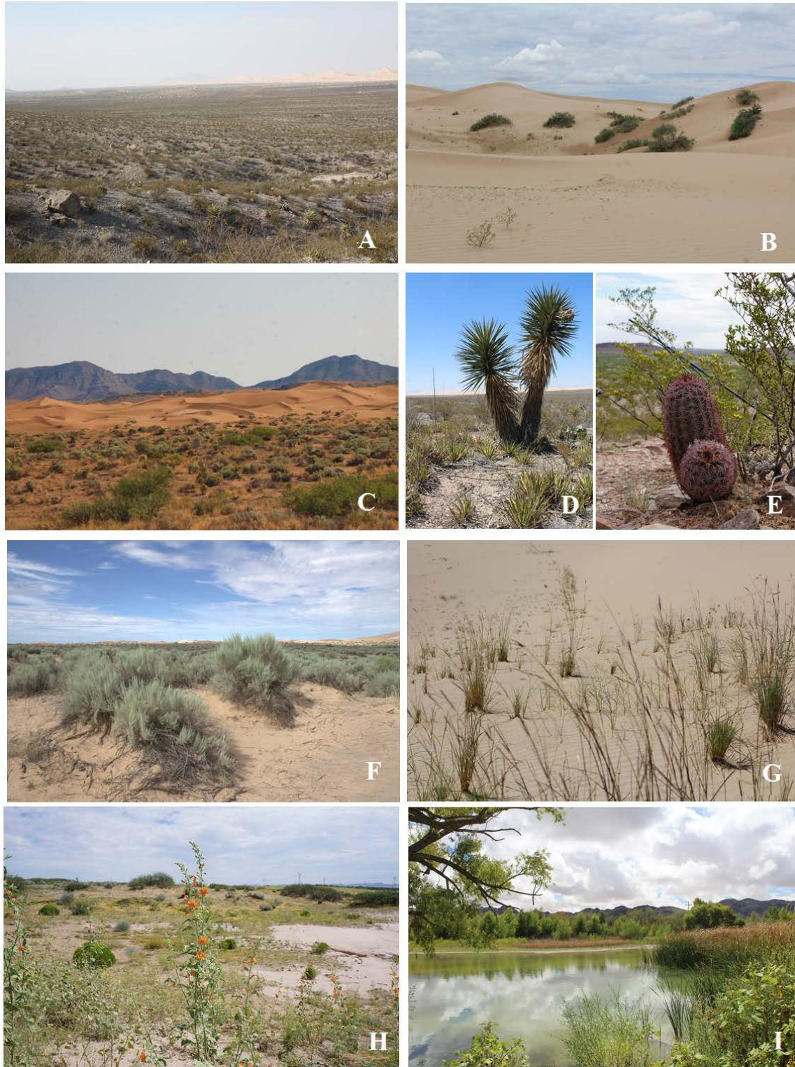
Figure 2. Landscape and vegetation of the Médanos de Samalayuca protected area. A) Mixed desert scrub dominated by Larrea ; B) Sand dune vegetation with Artemisia filifolia ; C) Sand dune vegetation with Artemisia sp.; D) Rosetophyllous scrub with Yucca and Agave lechuguilla ; E) Echinocereus dasyacanthus in mixed desert scrub with Larrea ; F) Artemisia filifolia scrub on semi-fixed dunes; G) Grasses on sand dunes; H) Sphaeralcea hastulata in secondary vegetation; I) Aquatic vegetation.